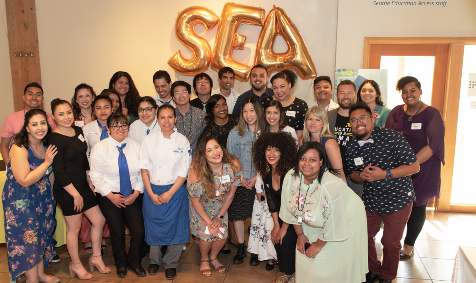
Seattle Education Access staff

Thank you to the University of Washington School of Social Work and the Community Center for Education Results for supporting this study with integrity and honoring the experiences of young people.